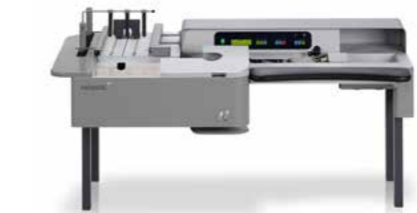
Automatic letter openers