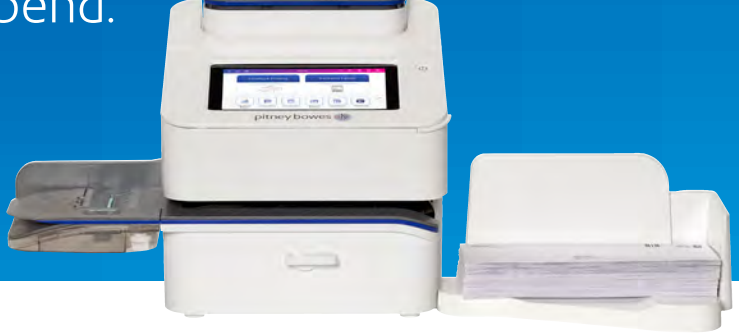
The SendPro C is the simplest, all-in-one technology for office mailing. Our user-friendly sending solution makes it easy to process mail, all from one place.

You can easily choose the right class or service to get your items delivered — all at the best price for your needs<sup>2</sup>.