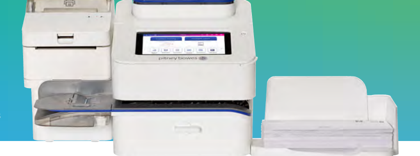
Simplify the way your office sends domestic and international parcels with Royal Mail and Parcelforce®

Worldwide. By integrating with the shipping label printer and the digital scale, the SendPro+ solution makes it easy to weigh, compare service options, print shipping labels, track parcels and manage expenses online—for both carriers, all in one easy-to-use solution. What's more, you'll save up to 75% on Parcelforce retail rates<sup>3</sup> and take advantage of Royal Mail Delivery Confirmation service and preferential Mailmark<sup>™</sup> pricing, with savings of up to 33.8% versus stamps<sup>4</sup>.